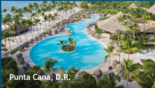
Punta Cana, D.R.