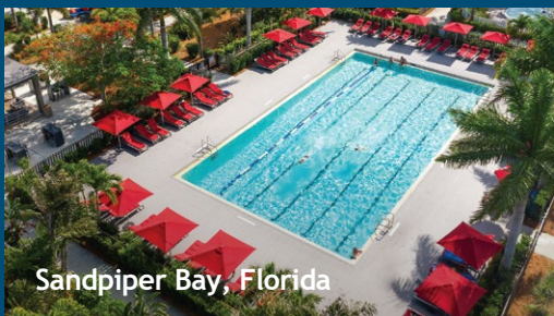
Sandpiper Bay, Florida